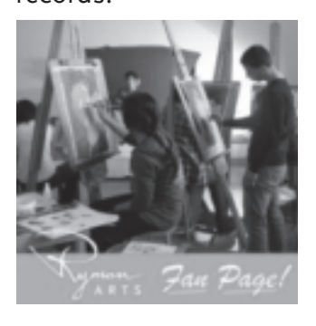
Become a fan of Ryman Arts on Facebook.

We are doing our part to help the environment by doing more of our communication electronically and sending less paper. Be sure we have your email address to receive the latest news about Ryman Arts and invitations to events. Go online to www.rymanarts. org and click on "Join the Ryman Arts Mailing List." at the bottom of the page to add your email address to our records.