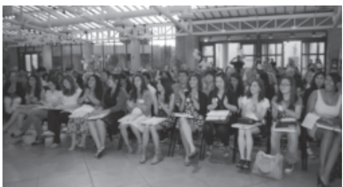
Ryman Arts graduation at California African American Museum, 2010