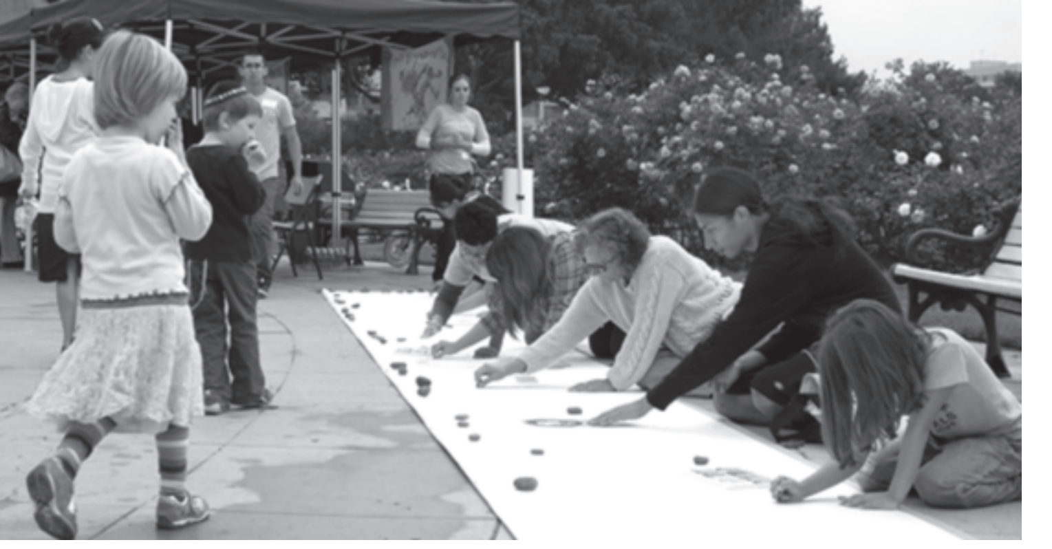
Families join Ryman Arts at Exposition Park as part of The Big Draw LA.