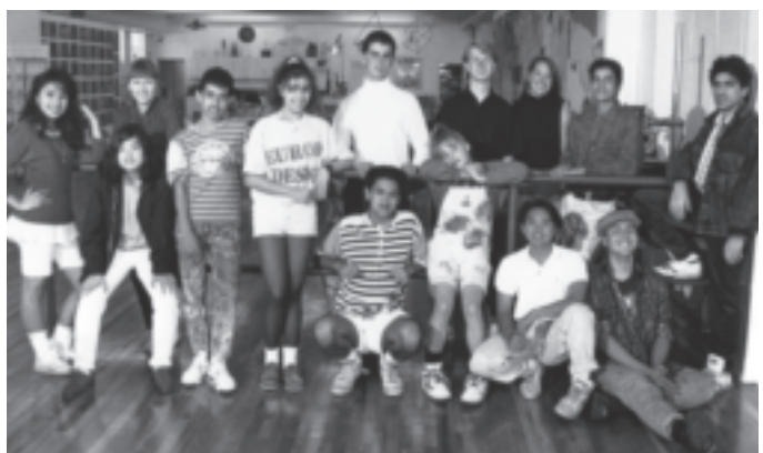
The first Ryman Arts class, 1990

Twenty years of Meeting a vital need, Transforming lives, Investing in the future.